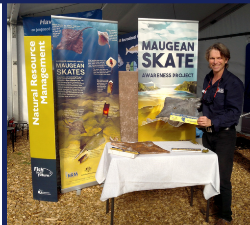
Four pullup banners detailing the life cycle of 'Macquarie Harbour's Special Maugean Skates' were designed and distributed to members of the Stakeholder Reference Group to utilise for raising awareness.

CCNRM attended an ex-situ conservation meeting with NRE, IMAS and Australian Govt reps. CCNRM have submitted a funding proposal to the Regional Delivery Partners Program that if successful would support an urgently-needed five-year Maugean Skate surrogate breeding program. The project would also facilitate improved detection and monitoring of the species with new technology and include a community engagement component which would build on the success of the activities that have been funded by the Environment Restoration Fund.