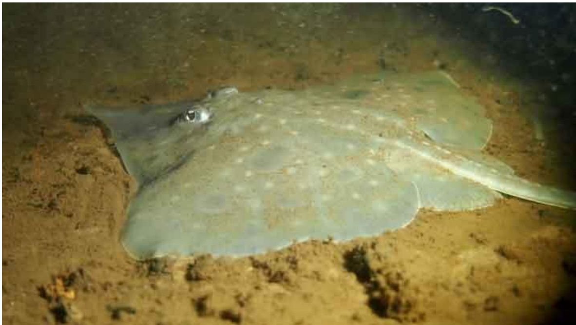
Maugean skate Zearaja maugeana.

The National Recovery Team for the Maugean Skate was formed in July 2023. This Roadmap of Agreed Actions has been developed by the Recovery Team following a series of Recovery Team and technical Working Group meetings which included national and international experts and local practitioners to identify and prioritise the immediate and short-term actions required to achieve the primary objective of the Recovery Team: to prevent the extinction of the Maugean skate and maximise its recovery in the wild, while simultaneously minimising the impact of conservation actions on local communities and industries.